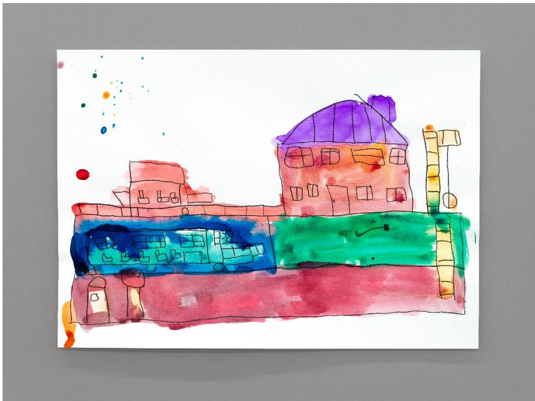
Happy Place, ink and pen on paper, mat board.