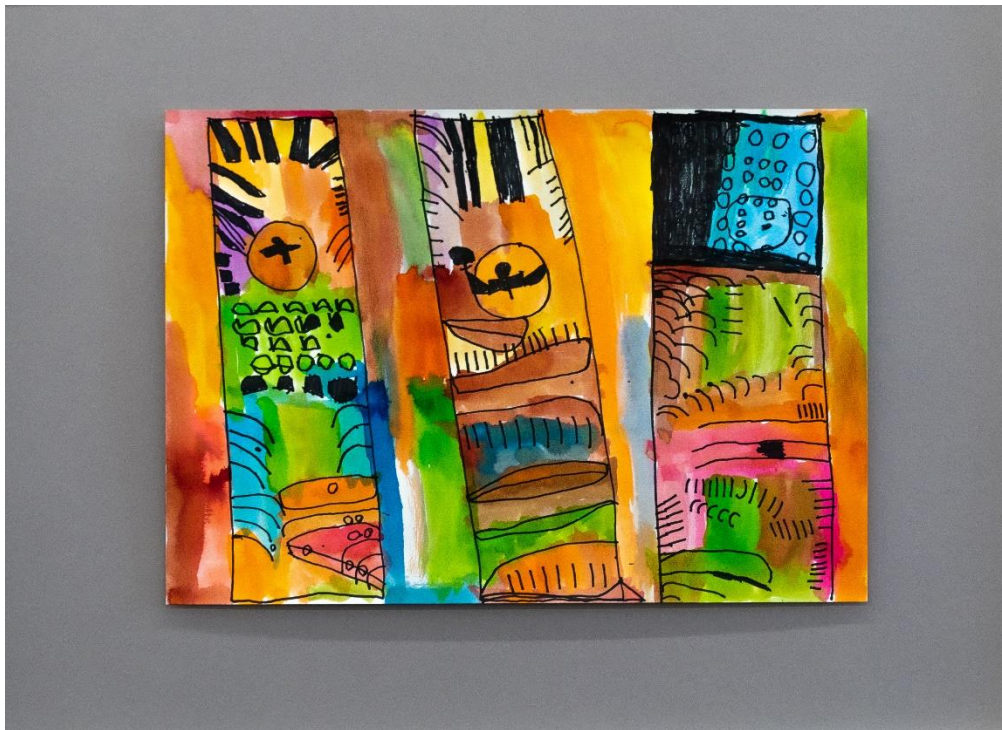
Boxes and Owls , ink and pen on paper, mat board.